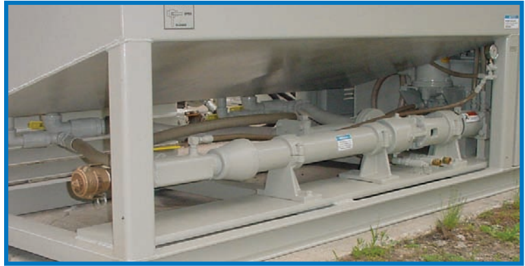
Non-Pulsating Screw Pump