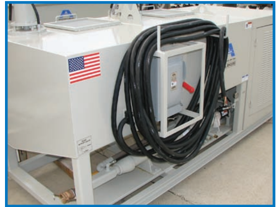
Electrical disconnect switch with 100 ft. 3 phase electric cable for connecting to power supply.