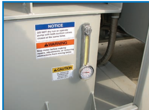
Hydraulic Tank Sight and Temperature Gauge