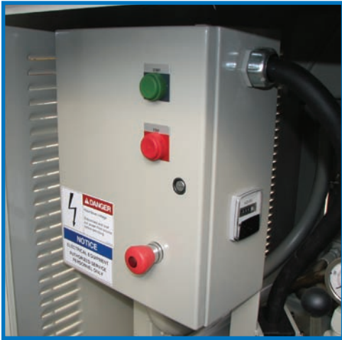
Control panel start and stop buttons with E-Stop and hourmeter for 30HP electric motor.