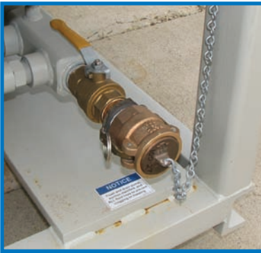
2" Pump Outlet