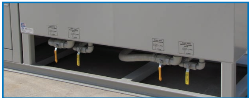
Mixing Tank Suction & Recirculation Valves