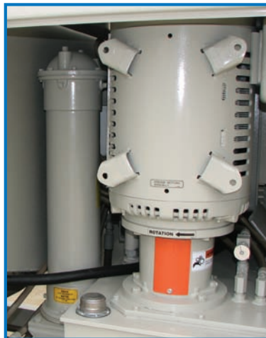
Heat Exchanger & 30 HP Electric Motor