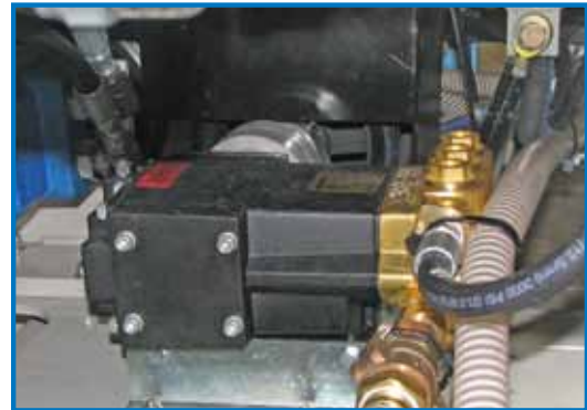
Jetting Piston Pump (2) 8 or 16 gpm @ 2,500 psi Maximum