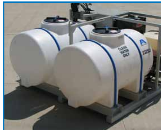
Separate 325 gallon (1,230 L) tanks for lubricant and jetting. Large opening for ease of filling.