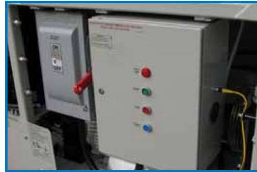
Electrical Controls (2325E)