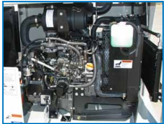
30 HP @ 3,000 rpm Diesel Engine (2325D)