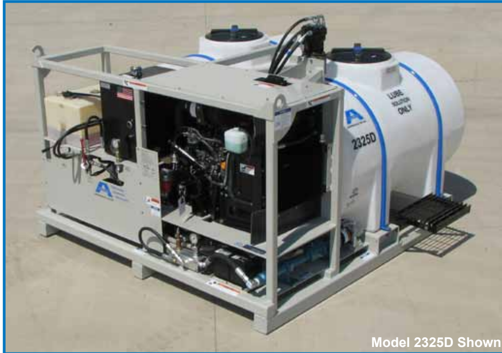
Model 2325D Shown