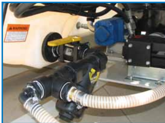
Open/Close valve at tank outlet.