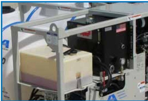
Fuel 18 gal (68 L) and Hydraulic 25 gal (94.6 L) Tanks