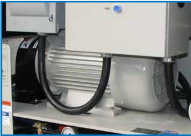
30 HP @ 1,750 rpm Electrical Motor (2325E)