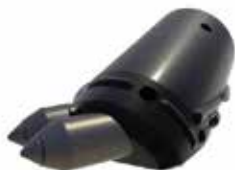
TriHawk III P0050-162