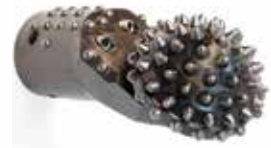
TriHawk VI P0050-163