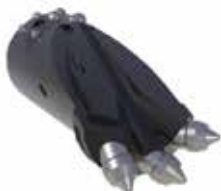
TriHawk I P0050-164