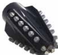
TriHawk IV P0050-161