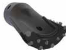
TriHawk V P0050-160