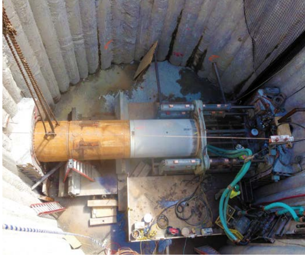
First MTBM launch August 15 2014 from a 45 foot deep secant pile shaft using an Akkerman with an MT860K jacking frame