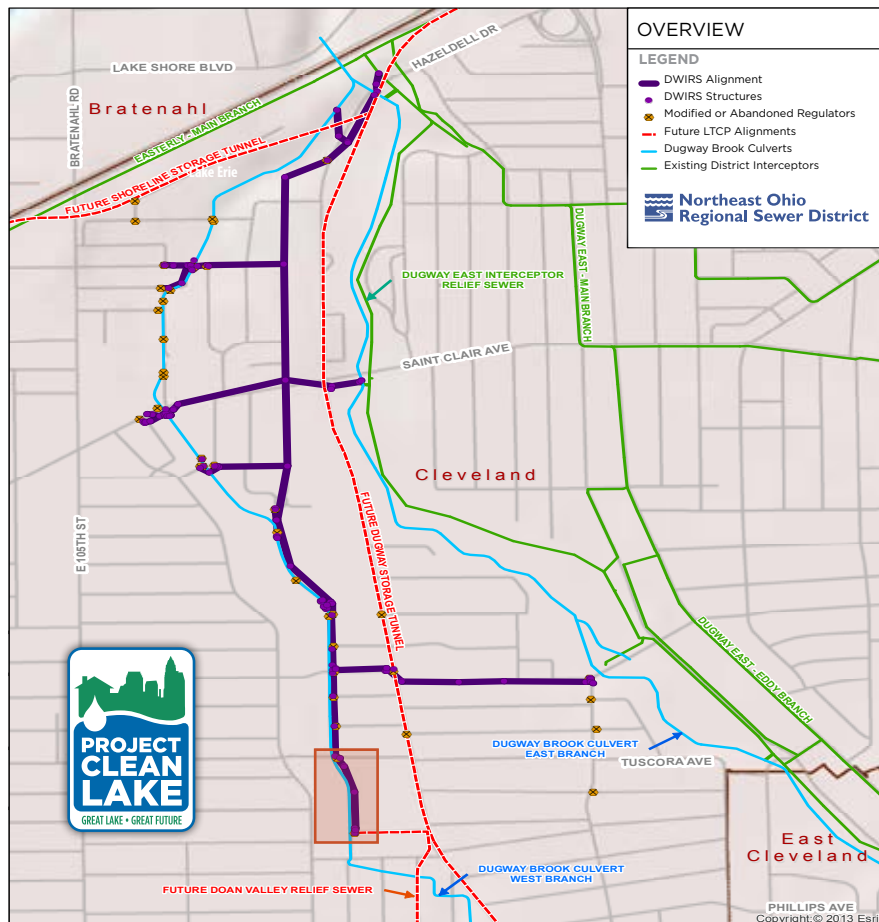
Project Clean Lake plan overview of DWIRS with location of curved microtunnel segment highlighted. Southern end runs close to existing culvert

Because of the project specific soil conditions and elevated water table, two Microtunnel Boring Machines (MTBMs) with capability to continuously pressurize the mining face were used. The first MTBM drive was launched in August 2014 from a 45-foot deep secant pile shaft with an Akkerman SL60 MTBM. The SL60 was used throughout the project for the 48-inch RCP sewer, including a 915 LF run through shale, while an Akkerman SL74 was deployed on all the 72-inch drives including the 700 LF of curved microtunnel. Both MTBMs were equipped with an increase kit so that the final bore diameter would accommodate the outer bore diameter of the jacked pipe. The machines performed very well in the various ground conditions encountered during tunneling operations.