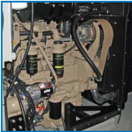
Four Cylinder, 99 HP Tier III Diesel Engine