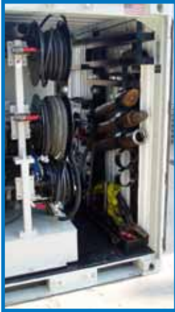
Walk-Through Tooling Storage Area