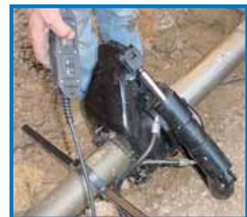
Pilot tube breakout tool is used in the reception shaft to loosen the pilot tube joints.