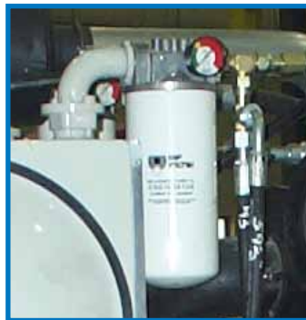
Filtered Hydraulic Return Oil With Indicator