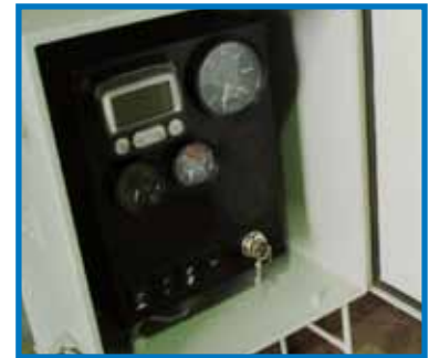
The remote pendant contains the engine tachometer, hourmeter, engine oil pressure gauge, water temperature gauge, electronic engine speed control, and ignition switch.