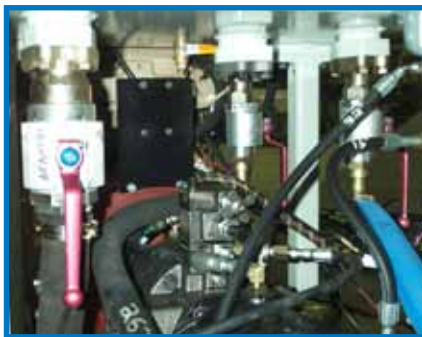
Suction Line Hydraulic Shutoffs For The Feed Pump, And Cooling Pump