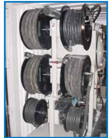
Hose Reels For Ease Of Hose Management