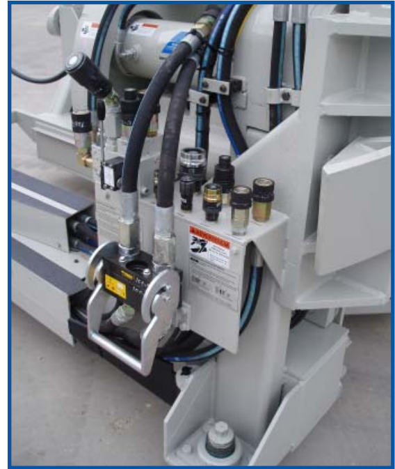
The quick couplers connect to the pressure, return, load sense, case drain hydraulic hoses from the GBM Power Pack, along with the PCH hydraulic hoses.