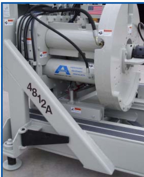
Four cylinders provide up to 200 ton thrust capacity.