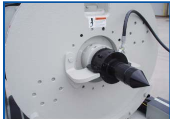
Drive Swivel Adapter With Fluid Connector & Alignment Adapter