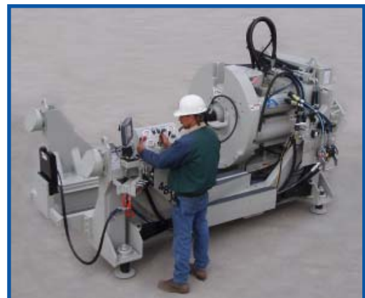
Operator control center for ease of operating and monitoring of system pressures.