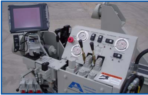
High pressure valves for jacking and rotation functions. Hydraulic pressure gauges for monitoring thrust, rotation, and cutter bit system pressures.